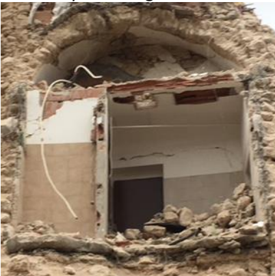
Photo of the 2016 earthquake in Italy

The image of rubbles left by the war or by the earthquakes that shake Italy every few years, has come to our mind; as well as the awareness that what we are dealing with now is an invisible, untouchable, boundaryless danger.